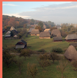
ETHNOGRAPHIC PARK OF CLUJ-NAPOCA