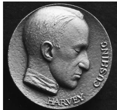
Medal presented to all participants as a souvenir of the Second International Congress