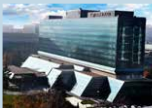
CROWNE PLAZA BELGRADE 4* HEADQUARTER HOTEL

https://www.ihg.com/crowneplaza/hotelsus/en/belgrade/begcp/hoteldetail