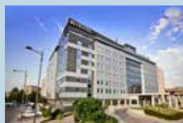
IN HOTEL 4*

https://www.falkensteiner.com/en/hotel/belgrad/the-hotel