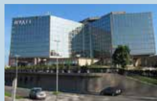
HYATT REGENCY 5*

https://www.ihg.com/crowneplaza/hotelsus/en/belgrade/begcp/hoteldetail