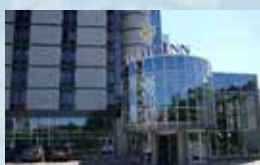
TULIP INN PUTNIK BELGRADE 3*