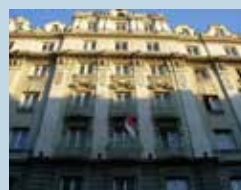
HOTEL PALACE 4*

https://www.ihg.com/holidayinn/hotels/us/en/belgrade/begbg/hoteldetail