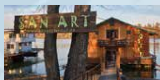
HOSTEL SAN ART