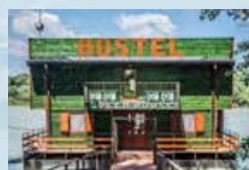
HOSTEL GREEN HOUSE