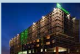
HOLIDAY INN 4*

https://www.ihg.com/holidayinn/hotels/us/en/belgrade/begbg/hoteldetail